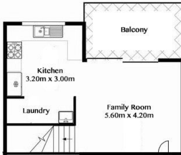
Ground Floor Approx area = 52.1 sqm

TOTAL APPROX FLOOR AREA = 87SQM Measurements are not to scale. For illustrative purposes only