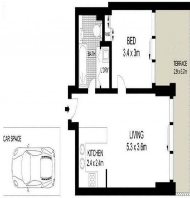
LOWER GROUND LEVEL