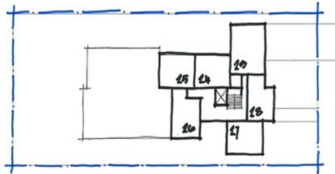
SECOND LEVEL 1: 500

Boarding House Development 14 Rowley Rd, Guildford