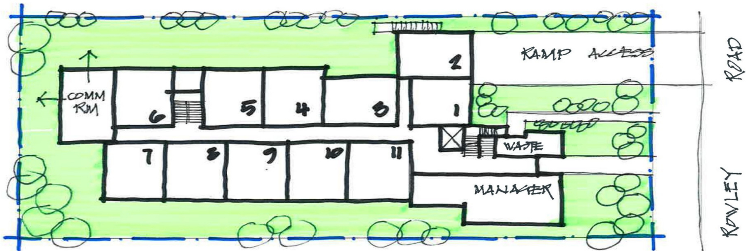
GROUND LEVEL 1: 500