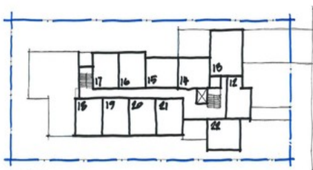
FIRST LEVEL 1: 500