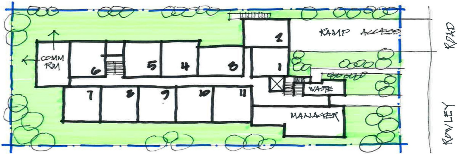
GROUND LEVEL 1: 500