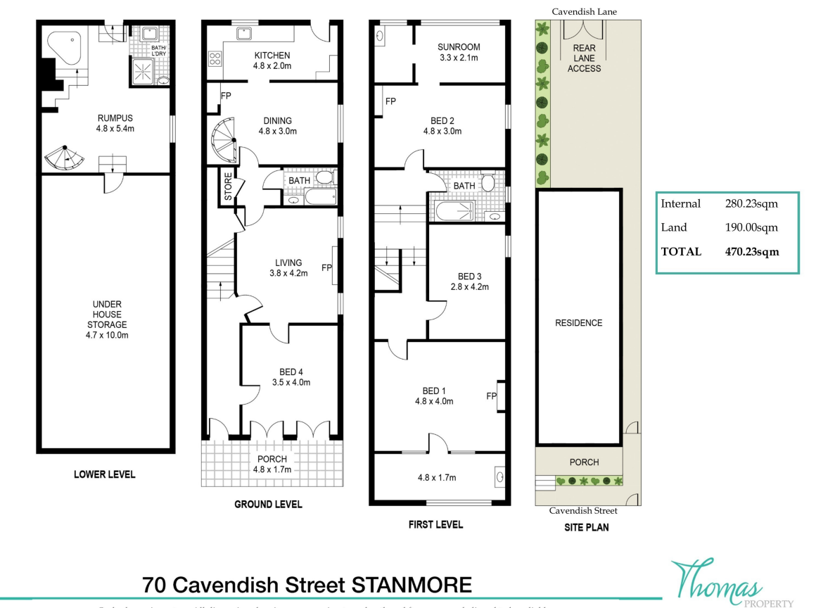
Scale shown in metres. All dimensions herein are approximate and gathered from sources believed to be reliable. Whilst every effort is made for the accuracy of our floor plans, interested parties should rely on their own enquiries.